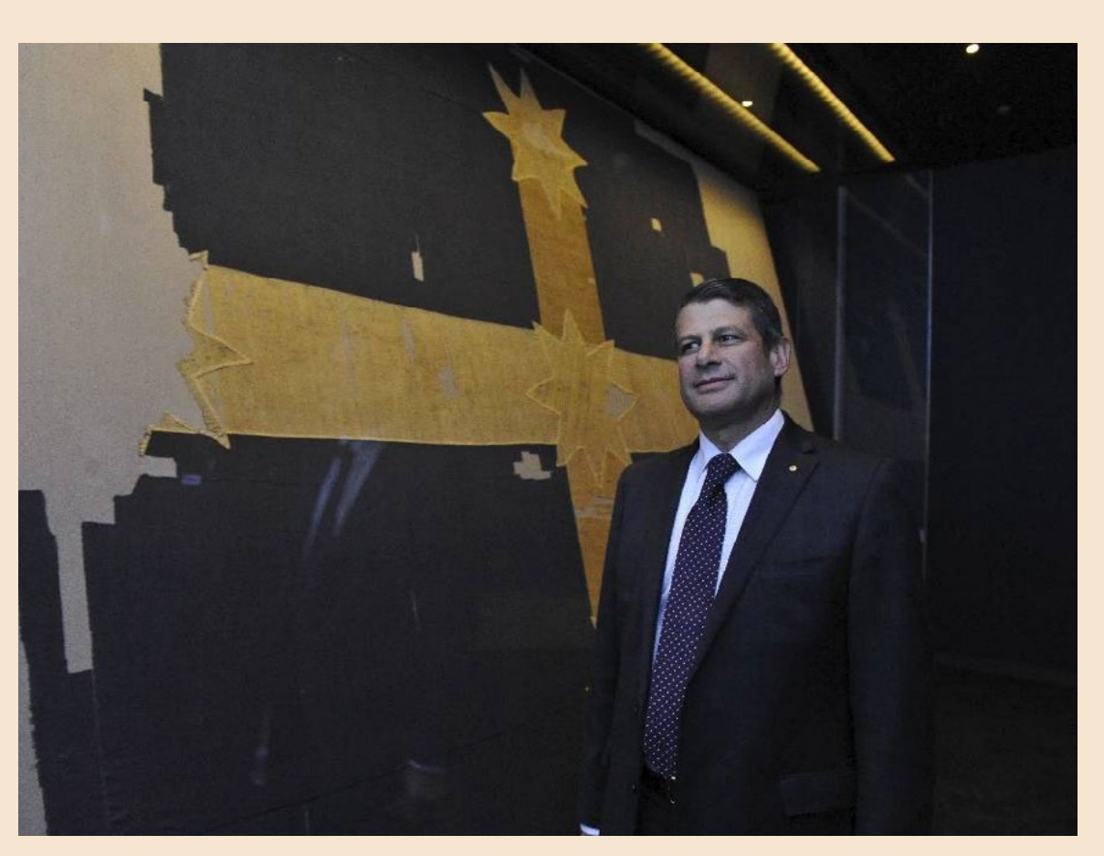
Former Victorian Premier Hon. Steve Bracks with the Flag of the Southern Cross

'I believe Eureka was a catalyst for the rapid evolution of democratic government in this country and it remains a national symbol of the right of the people to have a say in how they are governed. The principles for which the diggers, fought are universal – human rights, justice and tolerance. These priorities are as relevant today as 150 years ago.'