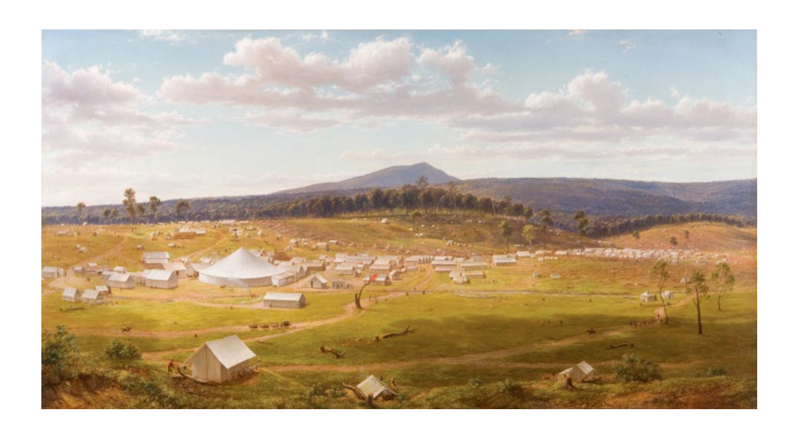
Eugene von Guérard Old Ballarat as it was in the summer of 1853–54 1884 oil on canvas, mounted on board 75.0 x 138.6 cm Gift of James Oddie on Eureka Day, 1885 Collection of the Art Gallery of Ballarat