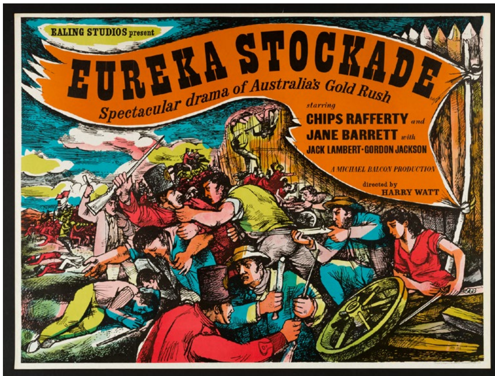
John Minton Eureka Stockade (1949), 1948 Illustration [poster] Courtesy of STUDIOCANAL

image p. 73: WEP Raffaello Carboni Sunnybrook Press The Eureka Stockade 1942 (detail) hardcover bound with linen and printed paper, illustrated text 28.9 x 21.0 x 3.1 cm Purchased, 1994 Collection of the Art Gallery of Ballarat